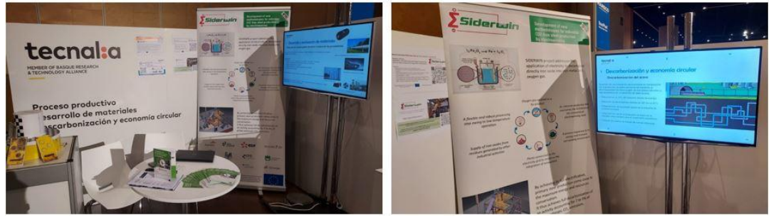
Tecnalia's stand at SteelTech 2021

In November, our partners from Tecnalia attended the first edition of the International Congress and Expo Steel Tech 2021 hold in Bilbao Exhibition Center, BEC (Spain).