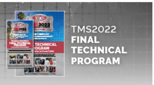
TMS 2022 Annual Meeting